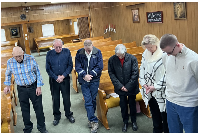
Mt. Zion Baptist and Hebron Baptist praying together.

The Place to Place and Heart to Heart Prayer Book in my region started in the Fairmont Association. Churches have been meeting together and praying for and with one another as the book moves from church to church. Recently, Mt. Zion Baptist prayed with Hebron Baptist as the people shared with their hearts with one another.