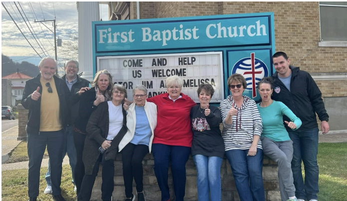
A delegation from Emmanuel Baptist traveled to Clendenin First Baptist to join them in prayer.

At last year's WVBC Annual Meeting, we kicked off a prayer initiative, inviting our churches to pray with one another and for one another. To help facilitate this initiative, four prayer books were designed that are currently traveling church to church around the state. In my area, the prayer book started in the Kanawha Valley Association.