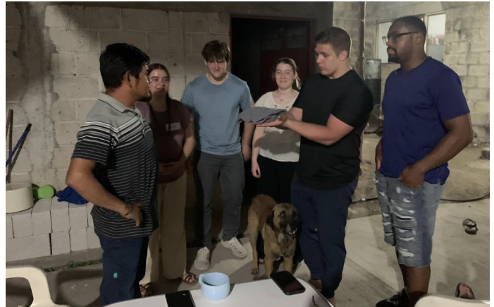
Last year's Fairmont State BCM mission team also served in Mexico.