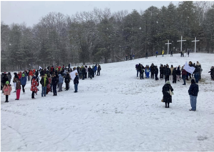
This year, God provided plenty of snow for Snow Camp!