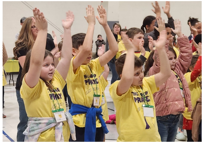
The children doing the hand motions during worship.