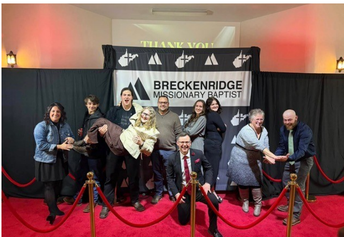
Breckenridge Missionary Baptist rolled out the red carpet to celebrate their volunteers.

For the past three years, we have gathered our volunteers to celebrate their hard work. But this year, we took it up a notch with a gala theme. We encouraged a semi-formal dress code (though it wasn't required) and pulled out all the stops—a red carpet, great food and even a 360 video booth. It was a night to remember and one that made a real impact on our team.