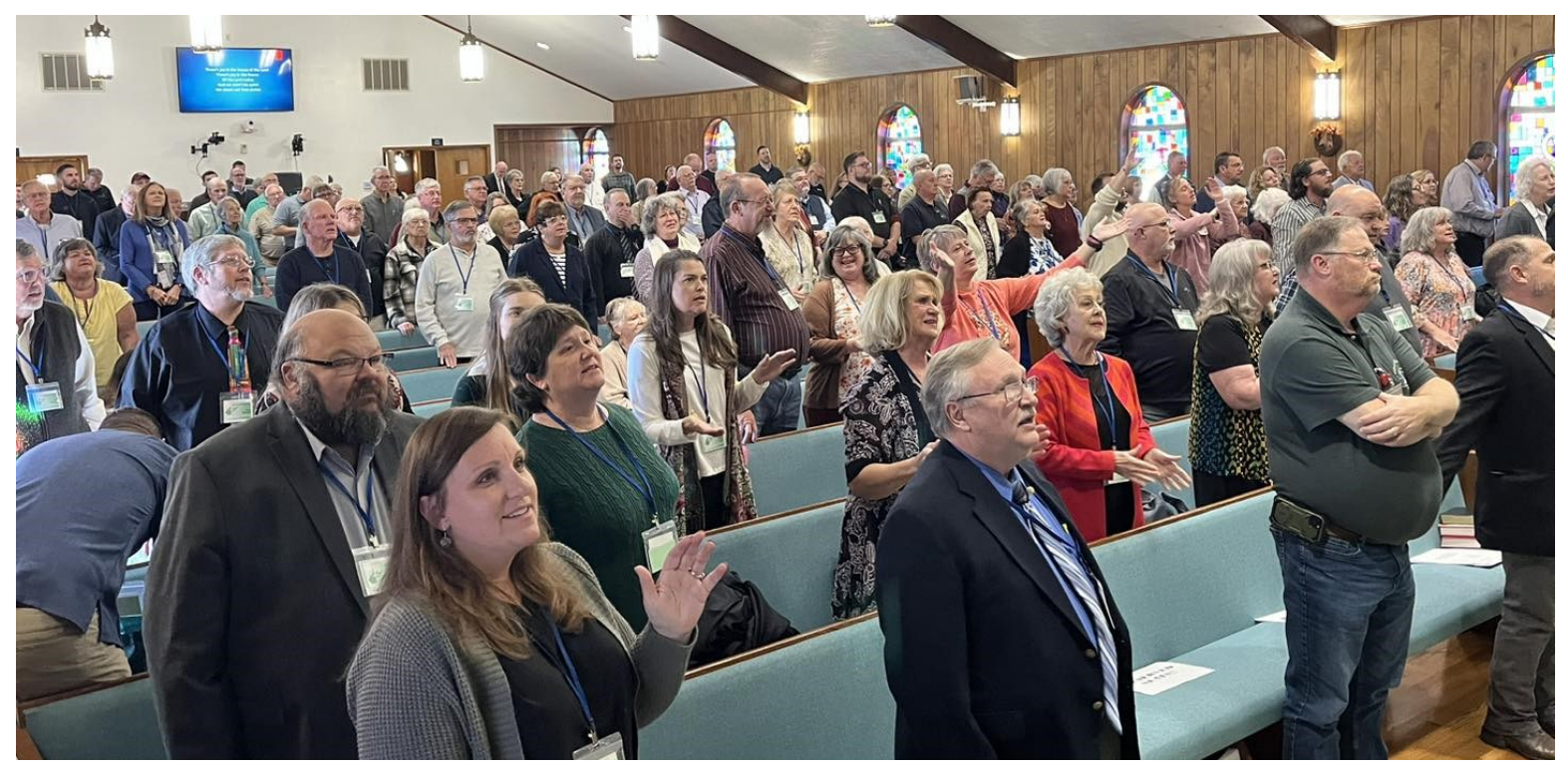
More than 225 individuals attended this year's Annual Meeting at Calvary Baptist Church.