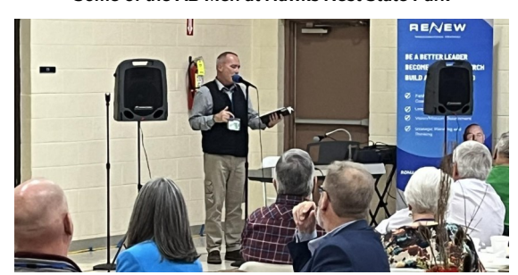
Baptist Campus Ministry Banquet