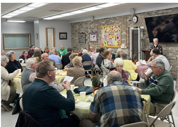
WV Baptist Education Society Luncheon