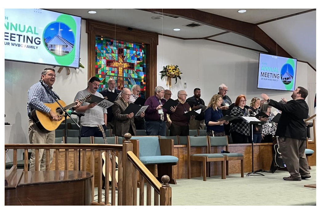
The Pastors Choir leading the congregation in a gospel medley