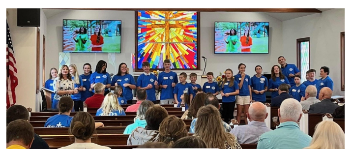
Youth singing during Rock Grove Baptist's celebration service.

Rock Grove Baptist (Broad Run) celebrated 150 years of ministry on October 13th. The church invited their families, guests, former pastors and area churches to worship with them as they celebrated and remembered God's faithfulness over the years. Several people shared through song and testimony about the goodness of God. The church also planned a marriage retreat this fall at Stonewall Resort.