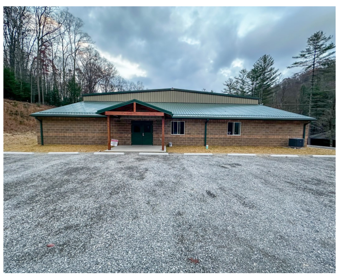
Construction on the Sunny Day Activity Center is almost complete!

What a difference a year makes! In March, we broke ground, excavation began, the foundation was poured in May, the building was constructed in August and the active construction phase was complete in November!