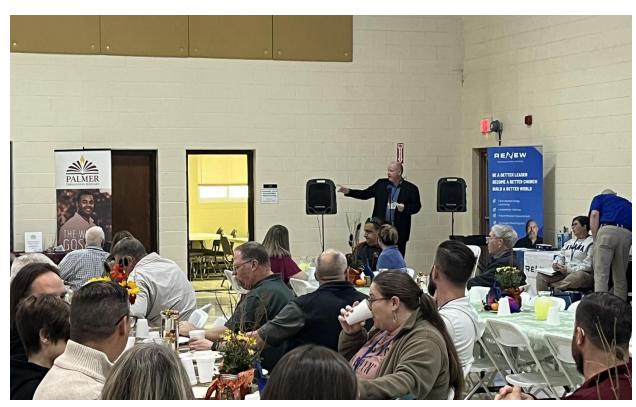
Palmer Theological Seminary Luncheon