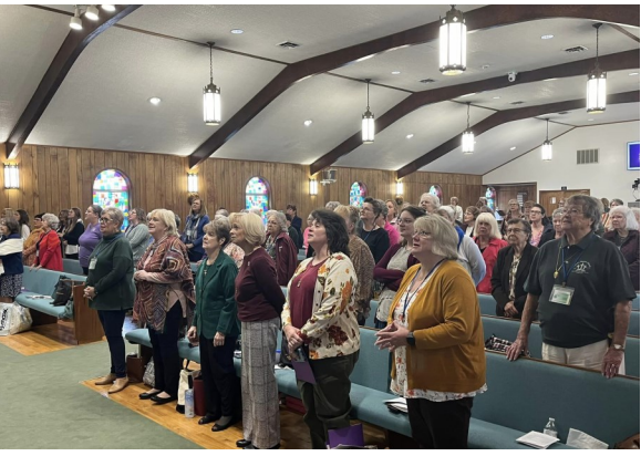
More than 100 ladies participated in Women's Day