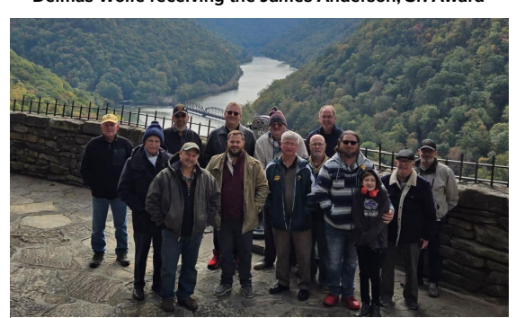
Some of the AB Men at Hawks Nest State Park