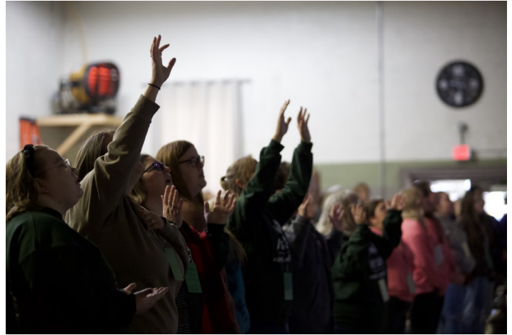
A time of worship during Women's Camp.

Each year, we spend time together learning about missions. We have had several missionaries and their families come to share about their work for the Kingdom in the past. This year, we switched it up. Everyone split into a group with women from their