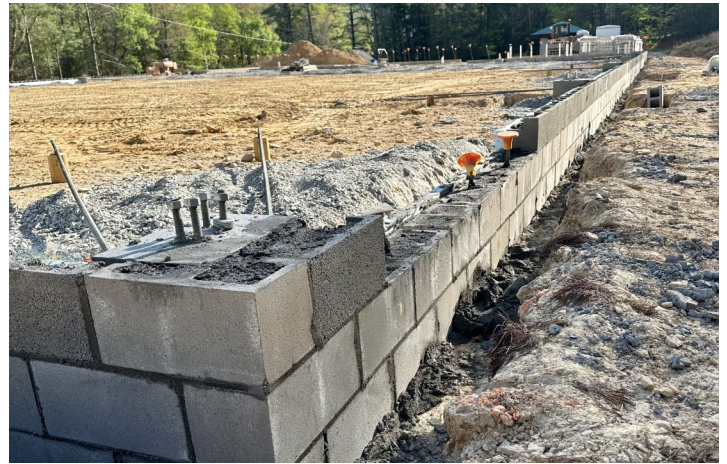
Installation of the masonry for the foundation stem walls.

In 2023, the Lord moved, and faithful donors gave nearly $700,000, reigniting the Sunny Day campaign! To date, almost $1.3 million has been raised, and there is less than $200,000 left to raise. I know that God's faithful people will provide for this project, which is scheduled to be completed in November.