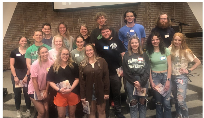
Graduating seniors from BCM at Marshall University