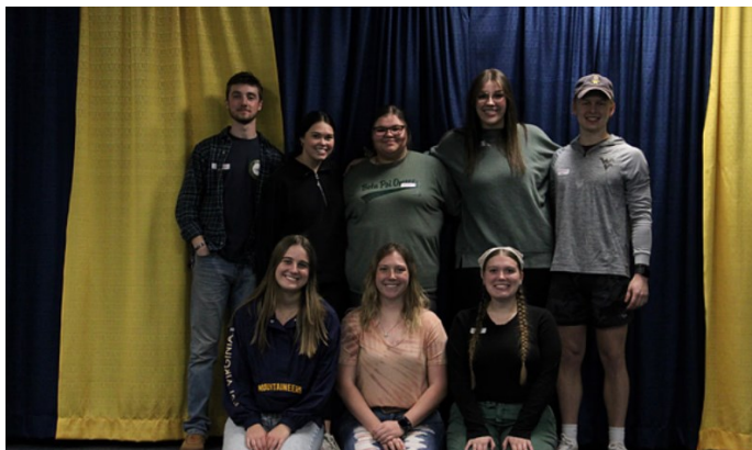
Graduating seniors from BCM at West Virginia University

As we seek to change lives on campuses all around the state, you can support this work directly by visiting wvbcm.com/give .