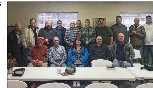
Pastors gather for the Pastors4Pastors Pre-Bible Conference Event.

has tried to "crop God out of the picture," and has also "buffered itself" against the gospel.