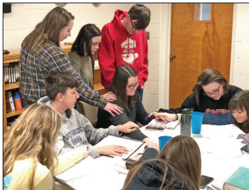
The current YLC group joins together in prayer.

Nominations for the 2020-2021 YLC will open May 15, 2020. Applications will be available at: https://www.wvbc.org/ministries/youth/ .