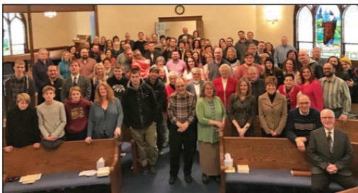
Members of Shinnston First Baptist Church meet in their renovated sanctuary.

After many months of work and many Sundays worshipping in the Lighthouse Activity Center across the street, Shinnston First Baptist Church (Judson) dedicated their newly renovated sanctuary, Sunday, January 19, 2020. The service featured special music, words of gratitude and encouragement from those involved in the project, a litany of dedication