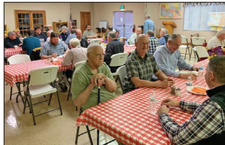
Nutter Fort First Baptist Church (Judson) men gather for the annual prayer breakfast event.