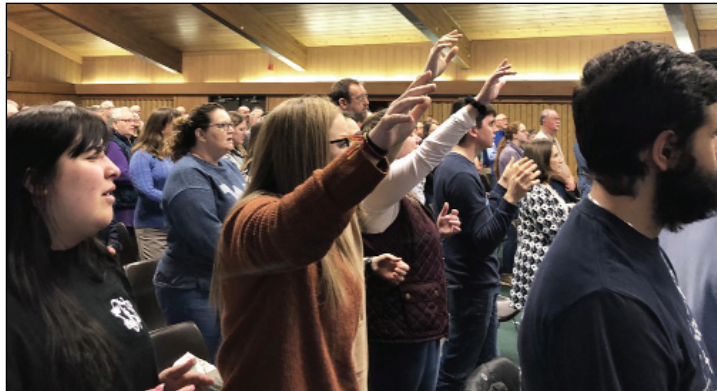
Interns join in worship during the Annual Training Event.

Of the more than 25 students that gathered, around 20 of them are expected to participate in the Ministry Internship Program , while six were accepted into the Missionary Internship Program . Funding for the former was made possible by a grant from the American Baptist Foundation, a grant from the Bowen Educational Trust, a gift from an individual and budgeted WVBC funding. For the latter, individuals are currently raising their support, much like what would be required of them if they were full-time missionaries. This not only provides them with the opportunity to learn about support-raising, but it also gives them the opportunity to develop a network of individuals and churches who might be interested in supporting them if they continue pursuing full-time missions.