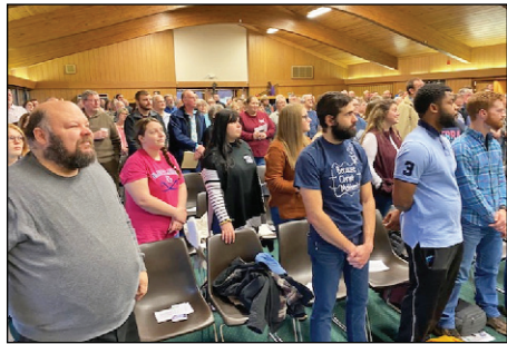
Annual Training Event attendees join together in worship at the Annual Training Event.

Our Annual Training Event was a big success this year. We offered 22 workshops over a variety of topics that are relevant - and in many cases urgent - for our churches. Each year, the entire convention staff works together to pull off this event - taught mostly