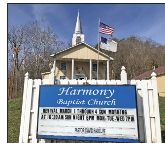
Harmony Baptist Church

The upper valley churches in the Kanawha Valley Association came together the week of March 22-27, 2020 in their annual roving revival. They met at different churches with a different pastor delivering the message each evening. It is always such a blessed time of worship when several churches come together to worship our Lord, to lead the lost to Jesus and to grow as His disciples together. To me, this is why we choose to be a family of churches, "Doing Christ's Work Together!"