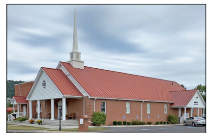
Romney First Baptist Church