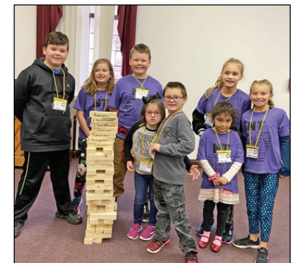
Spring Children's Rally attendees learn the books of the New Testament.

Reaching children with the gospel and teaching them about God's word is an essential aspect of our mission of Doing Christ's Work Together .