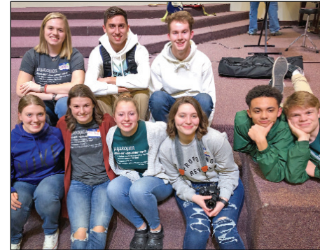
The Youth Ministry Planning Team (YMPT)

You know God is going to work powerfully when the weekend starts with the speaker issuing this challenge, "We were