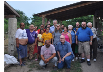
West Virginia Team in Hungary

In the past two years, West Virginia Baptists have worked with us and the Hungarian Baptists to