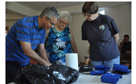
Working together for the health of Hungary Roma and Baptists with West Virginia Baptists