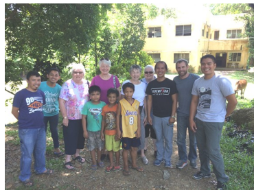
Group in Philippines

Maybe you have never heard of that gift, but I believe you have probably been sharing it with family, friends, and neighbors your entire life. You present this gift to people when you ask about their sick mother and then allow them to talk, or offer to help them refinish a cabinet, or watch their dog while they are on vacation, or take a cake to their home when there is a death in the family. See, you have been offering yourself, your “presence” all your life.