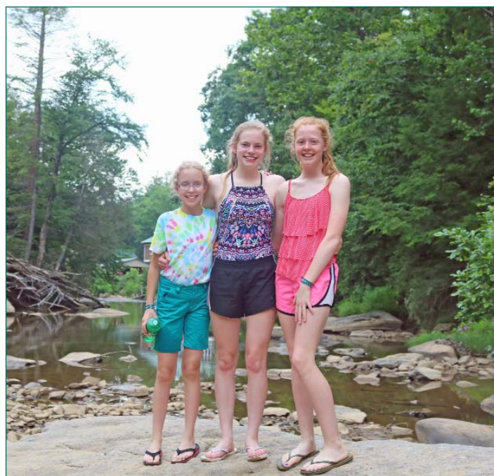
Looking to the future at the West Virginia Baptist Camp at Cowen.

Looking to the future, the Sunny Day Leadership and Activity Center provides a vision for increasing the ministry of Camp Cowen to our campers, the community of Webster County and to the West Virginia Baptist Convention. What will your part be in building the future of Camp Cowen today? We prayerfully ask you to consider donating your time, talent and finances as we continue to move forward in this ministry. Will you give of your time to volunteer on a workday or serve as a camp counselor? Is there a child or teen you can help get to camp this sum-