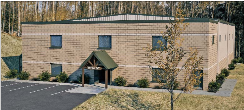
An artistic rendering of the exterior of the Sunny Day Leadership and Activity Center. It is time for the West Virginia Baptist Convention to build it with your commitments.