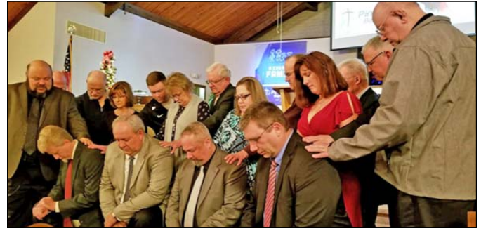
The families and attendees pray over the newly ordained at Pine Grove Baptist Church.

God delights in our obedience to act upon our individual callings and James 4:14 reminds us our roles are only temporal, "Yet you do not know what your life will be like tomorrow. You are just a vapor that appears for a little while and then vanishes away." Our agenda is God's agenda, that is, we must desire to present the gospel in order to have people fall in love with Jesus. John 14:6 is the most definitive passage, "Jesus said to him, I am the way, and the truth, and the life; no one comes to the Father but through Me." It is not a pluralistic god, it is the name Jesus that convicts and offends and it is to that point in all of creation to drive those around us to be in horror of the realization of