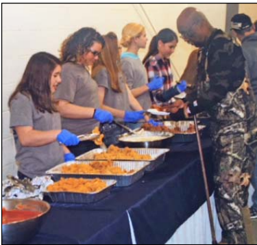
Future Farmers of America students serving at Parchment Valley Conference Center.

I am very blessed to report the ministry plan of Parchment Valley Conference Center is alive and well. Praise the Lord for our volunteers and donors. Through your faith, " Lives are being changed. " Several weeks ago, I was invited to the annual Ripley High School Future Farmers of America (FFA) banquet to represent our Parchment Valley Conference Center staff to receive the Future Farmers of America Honorary