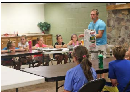
The Sunny Day Leadership and Activity Center will add more space for training in leadership and discipleship.

The time for commitment is here. Please complete the card at right and mail to West Virginia Baptist Convention, Attn: Jennifer, PO Box 1019, Parkersburg, WV 26102 by April 15, 2018.