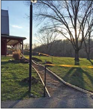
New sidewalks were added to make the walk to The Barn a little smoother.

Recently, our group of dedicated Parchment Valley Conference Center volunteers were busy breaking out old concrete from around the upper lodge road and tearing out rock at the sidewalks at The Barn (administration building). The areas was being framed up for concrete to be poured. There are several new and exciting construction projects taking place at Parchment Valley Conference Center that we need your help to complete: upgrading the camp ground, repairing Grapevine Chapel, installing