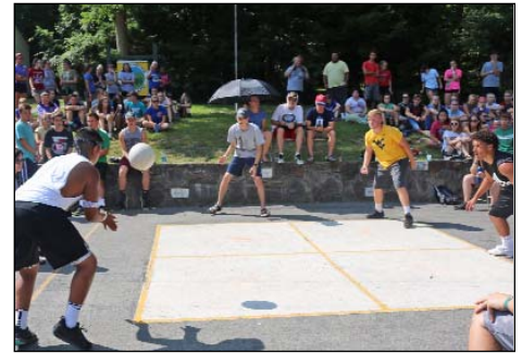
When it rains, campers can play in the gym of the Sunny Day Leadership and Activity Center.